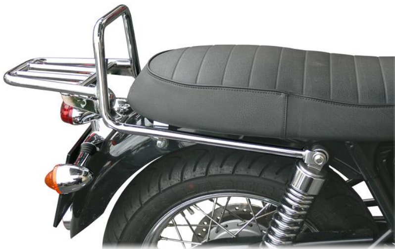
View of the assembled rack